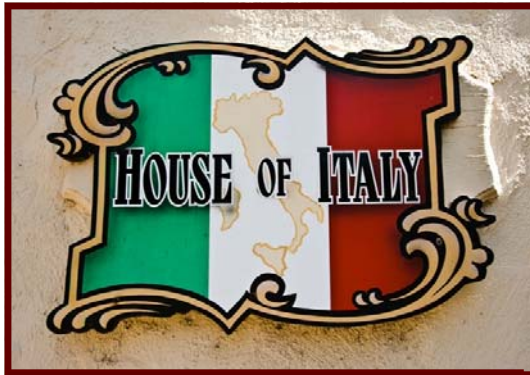
The House of Italy