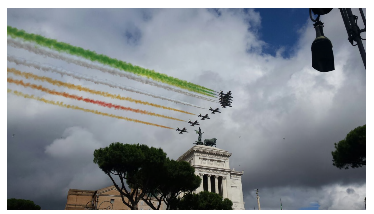
Monumento al Milite Ignoto—Piazza Venezia