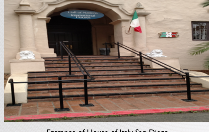
Entrance of House of Italy San Diego

Our mission is to offer to its members and the public through its cultural and social programs, an understanding and appreciation of the history and culture of Italy. Our vision is that our HOI members celebrate their Italian heritage and culture with the people of San Diego.