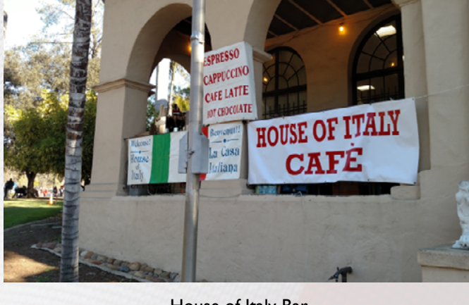
House of Italy Bar