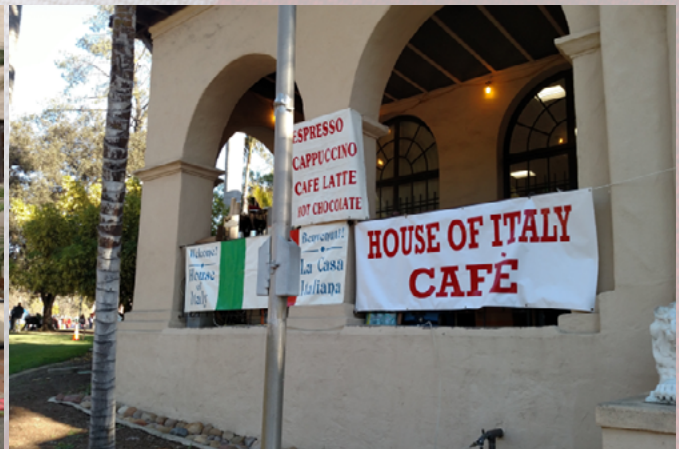
House of Italy Bar