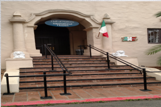
Entrance of House of Italy San Diego

Our mission is to offer to its members and the public through its cultural and social programs, an understanding and appreciation of the history and culture of Italy. Our vision is that our HOI members celebrate their Italian heritage and culture with the people of San Diego.