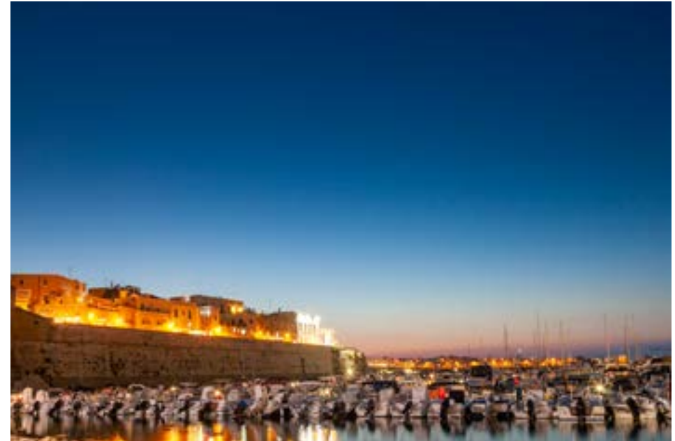
Otranto (Puglia)