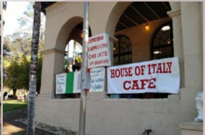
House of Italy Bar