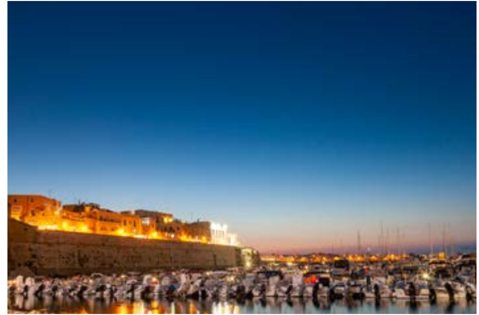
Otranto (Puglia)