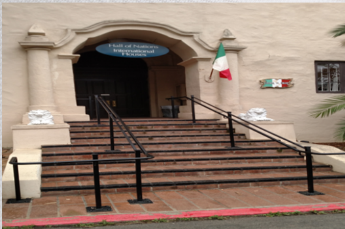
Entrance of House of Italy San Diego

Our mission is to offer to its members and the public through its cultural and social programs, an understanding and appreciation of the history and culture of Italy. Our vision is that our HOI members celebrate their Italian heritage and culture with the people of San Diego.