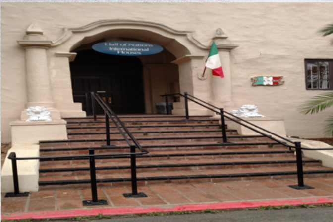
Entrance of House of Italy San Diego

Our mission is to offer to its members and the public through its cultural and social programs, an understanding and appreciation of the history and culture of Italy. Our vision is that our HOI members celebrate their Italian heritage and culture with the people of San Diego.